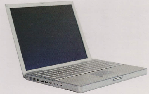
PRPro – online media contact application

Always the lowest price for the most accurate information – every year since 1971.