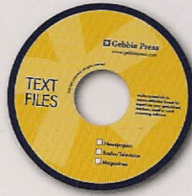
Directory on CD